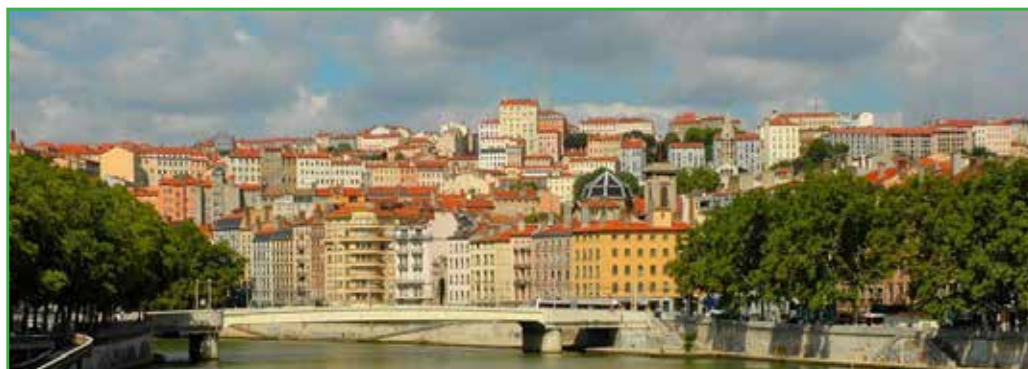
Basilica of Fourvière