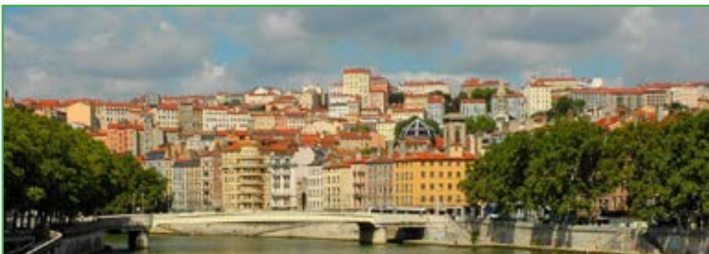
Basilica of Fourvière